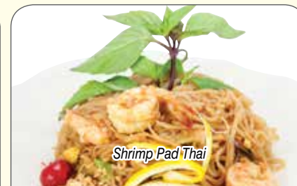
Shrimp Pad Thai